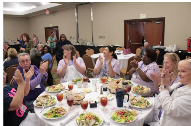
Johnson County and Rural North Texas members enjoy the Star Awards Luncheon